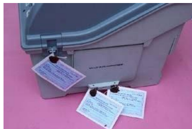
Sealing of Drop Box of VVPAT with Address Tag