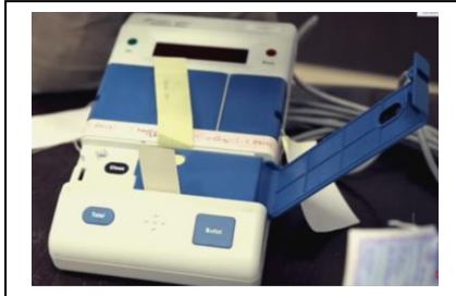
Fixing Green Paper Seal