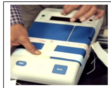
Sealing with Outer Paper Strip Seal (ABCD Seal)